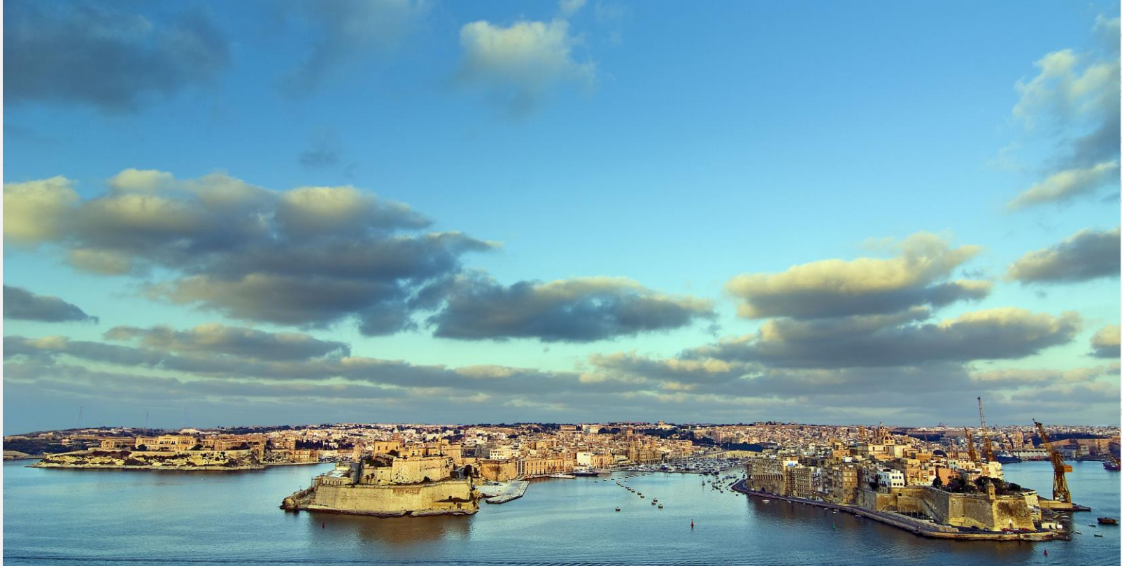
Caption of Image 1