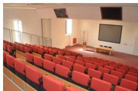
Main Hall – Auditorium (Level 2)