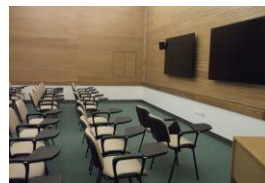
3 breakout rooms - 3 meeting rooms on Level 0 (ground floor)